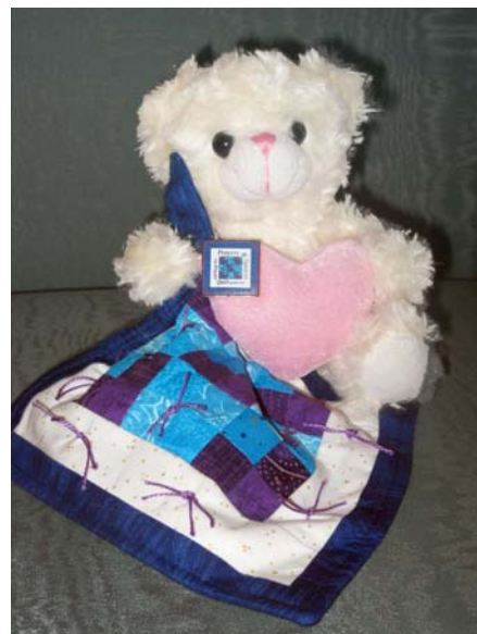
Patches holds a pink heart adorned with our logo pin, and of course, her very own prayer quilt. Her sister Flat Pat is identical, but – well – flat instead of fluffy.

As our new traveling ambassadors, Patches and Flat Pat will increase our opportunities to communicate with and reach out to Chapters that we don't know and/or wouldn't have a reason to contact. It will be interesting to chart and track their travels.