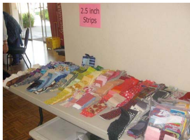
Fabric cut into strips and squares was available for new chapters to take back with them.